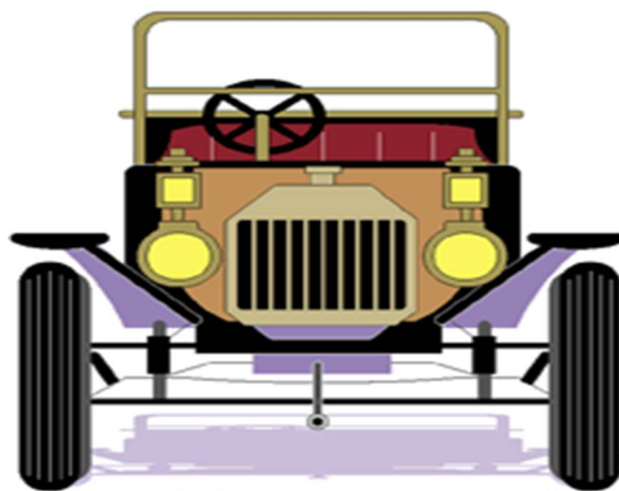
The Model T was introduced by Henry Ford on October 1, 1908.